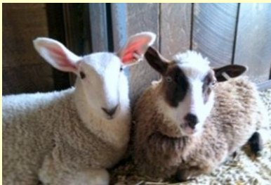
Radar and Zoro