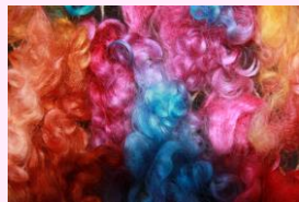
YARN & FLEECE