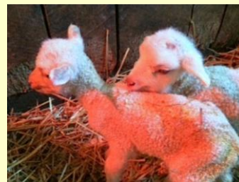
Pebbles & Bam Ba