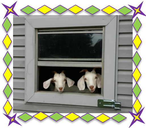
Ginger and Gilligan