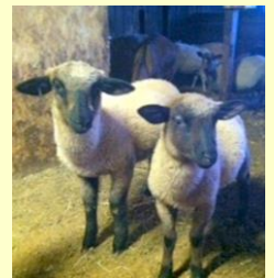
Lucy & Ethel